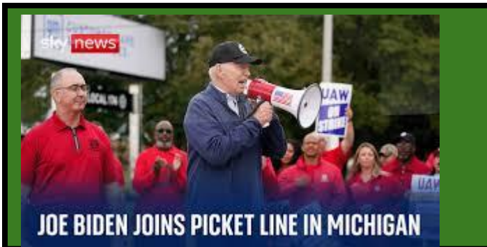
JOE BIDEN JOINS PICKET LINE IN MICHIGAN